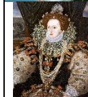
Queen Elizabeth I