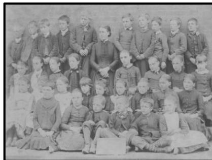
Middleforth School 1888